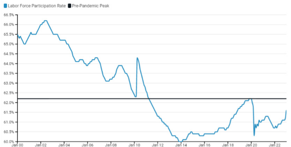
Labor Force Participation in Arizona Since 2000